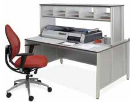
Automatic letter openers